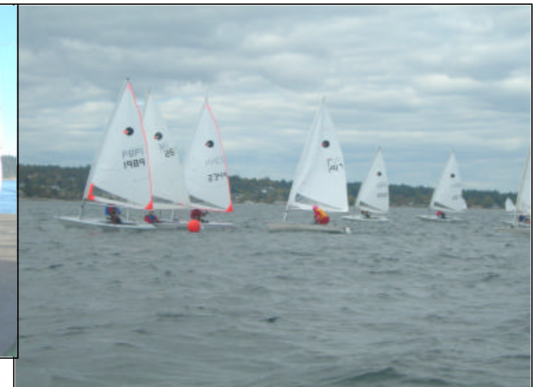
The byte fleet rounding the windward mark.