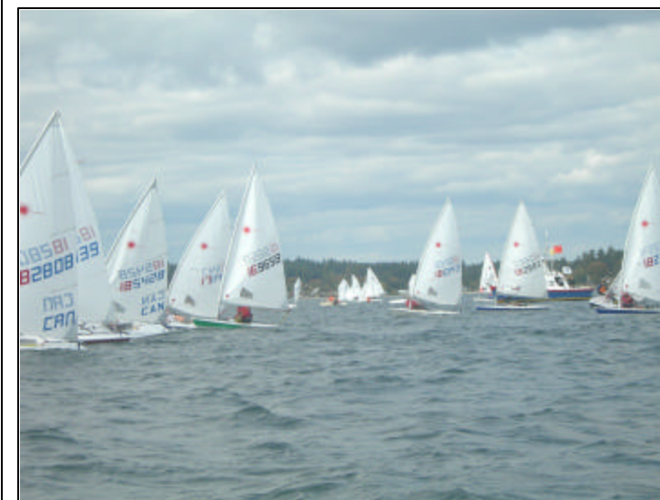
The laser fleet on the start line ready to go.